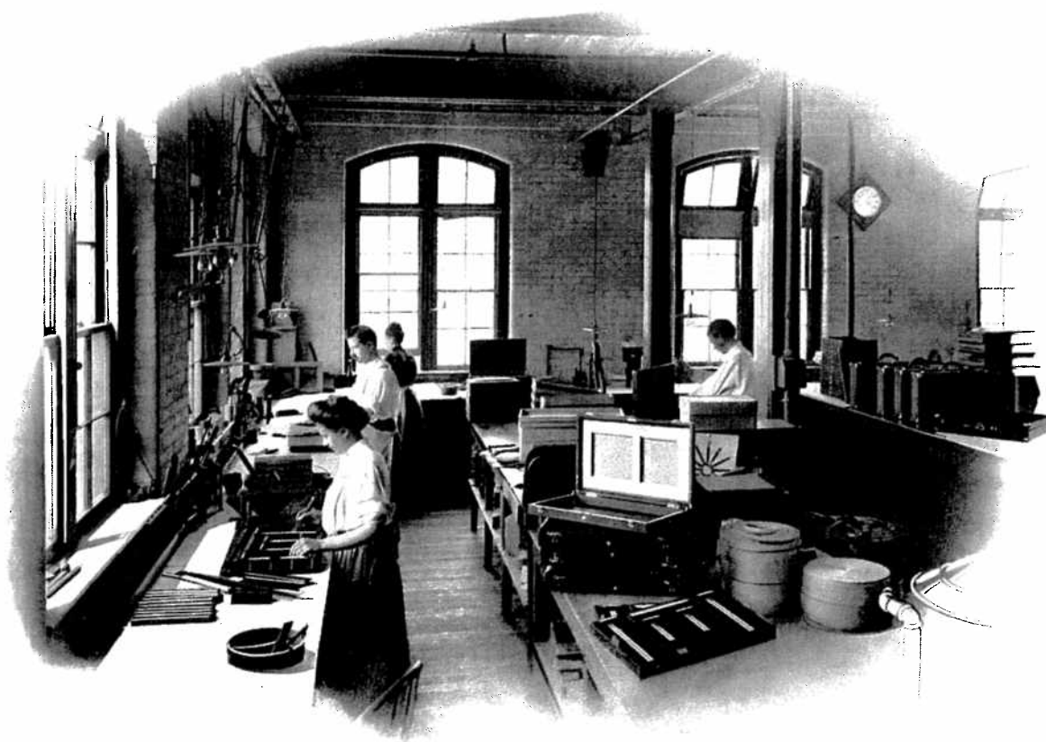
Office Style Case Making

No. 2080 style case is uniform in size with office cases designed to hold contents A, B, C, D and H See illustration on opposite page.