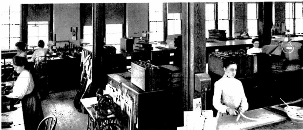
Traveling Style Case Making

Traveling, Dress Suit and Folding Style Cases are covered with black seal grain leather with nickel-plated trimmings, including quadrant stop for cover and with removable velvet lined tray with solid bottom. Space is provided underneath tray for stock, also with removable tray for interchangeable lenses, holding one gross pairs. The cover contains a pocket for holding test types. These cases are also furnished in tan leather if so ordered. Cases also furnished with oxidized bronze trimmings instead of nickel-plated if so ordered.