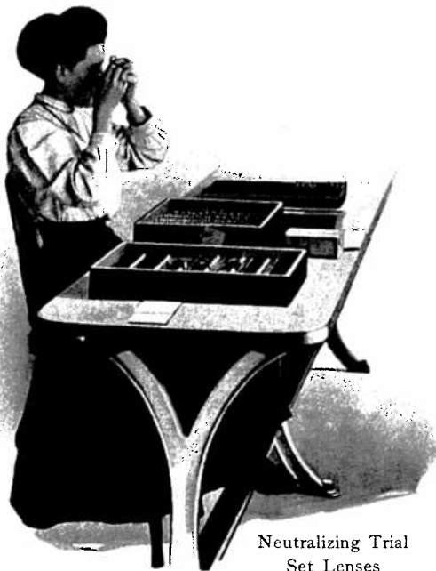
Neutralizing Trial Set Lenses

Automatic Tray Tilting Attachment This provides a means of automatically raising and lowering back of tray when case is opened or closed. This attachment will be furnished at a slight extra charge upon any office style cases except roll and glass front cabinets. See illustration, page 240.